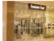
MIKADO Folding Door