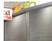
SLIMLINE Roller Shutter