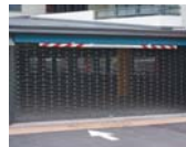
STADIUM Roller Grille