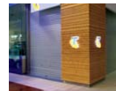
ARCADE 2 Roller Shutter