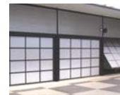
A1000 Tilt Up Door