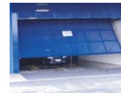
A1500 Fully Recessed Door