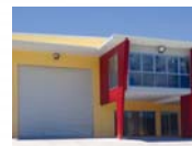
Q 100 Steel Roller Shutter