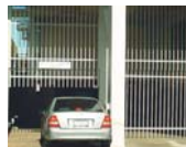
A5000 Vertical Lift