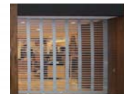
ARCADE 3 Roller Grille