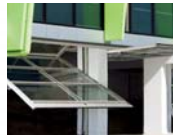
A2000 Hingeway Door