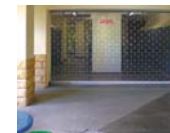
CASINO Aluminium Roller Grille