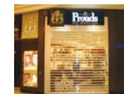
CLEAR ROLLER Roller Shutter